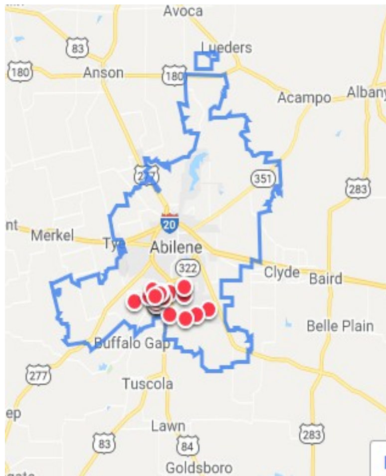
Wylie School District Map

It depicts slave owners, members of the KKK, and police officers, over time, kneeling on the neck of a Black man who is saying, “I can’t breathe,” clearly making a statement about the alleged murder of George Floyd and systemic racism and police brutality in the United States.